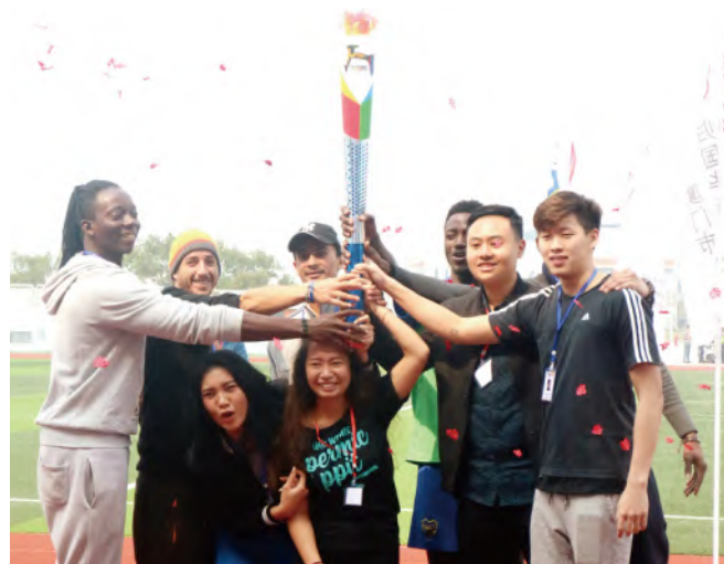
International Students' Sports Meeting