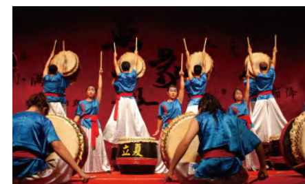
Drums of the Twenty-four Seasons