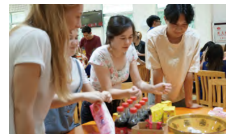
Mooncake Gambling of Mid-Autumn Festival