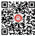
集美大学 微信公众号