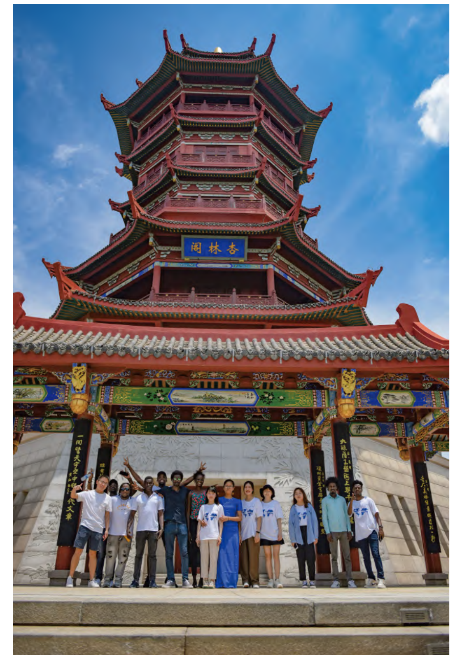
TAN KAH KEE Scholarship Students Visiting Xiamen Garden Expo Garden