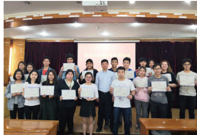
International Students Commendation Conference