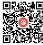
集美大学招生办 微信公众号