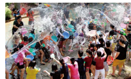
The Water-Sprinkling Festival