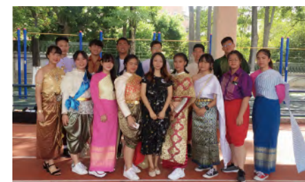
Thai TAN KAH KEE Scholarship Students' Participation in the Performance of Celebrating the Centenary of Jimei Middle School