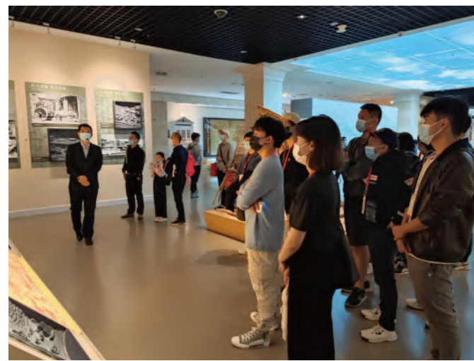
Visiting TAN KAH KEE Memorial Hall