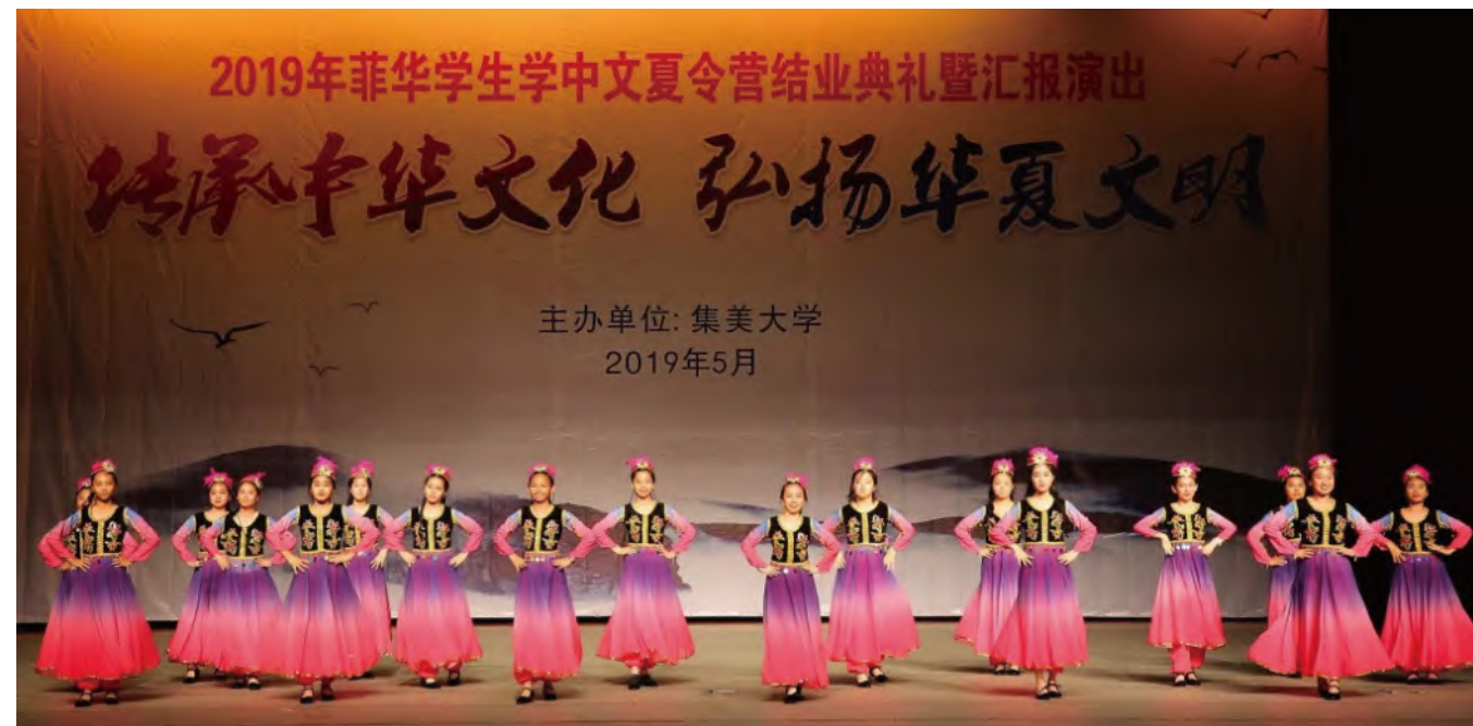
Report Performance of Filipino Chinese Students