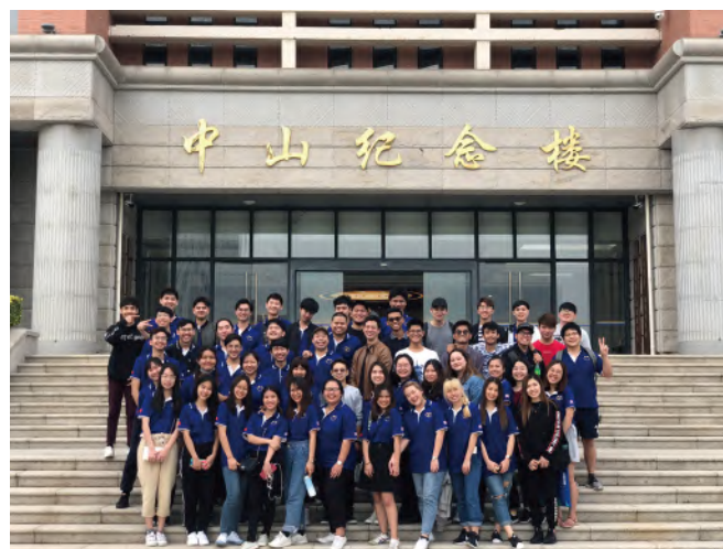
International Students Visiting the University History Hall