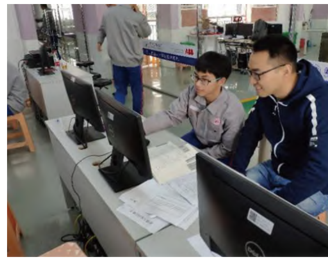
"The Maritime Silk Road" Students Practical Training in Robotics