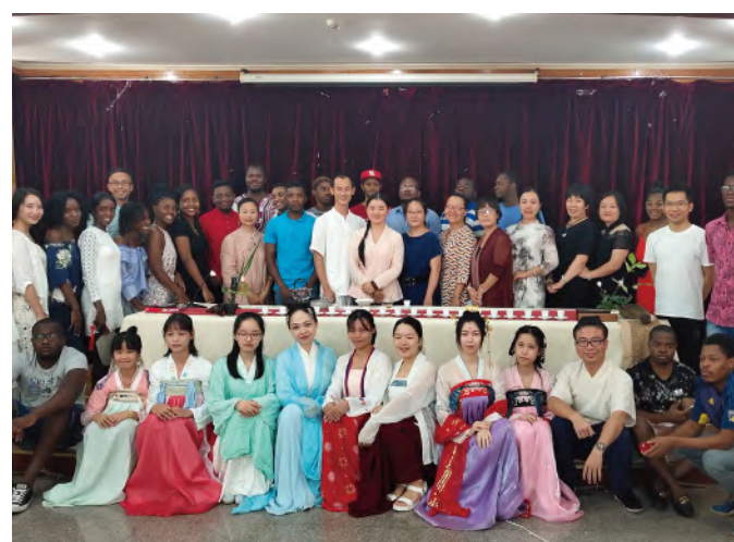
Angolan Tea Art Class