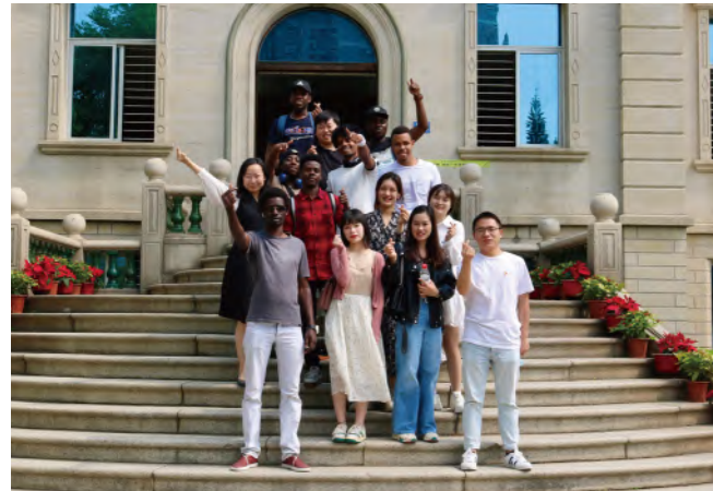
TAN KAH KEE Scholarship Students' Sightseeing of Xiamen Overseas Chinese Museum