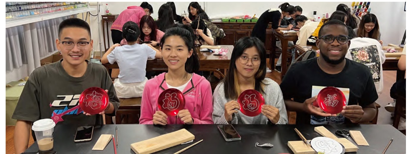
TAN KAH KEE Scholarship Students' Experiencing Activities of Southern Fujian Intangible Cultural Heritage