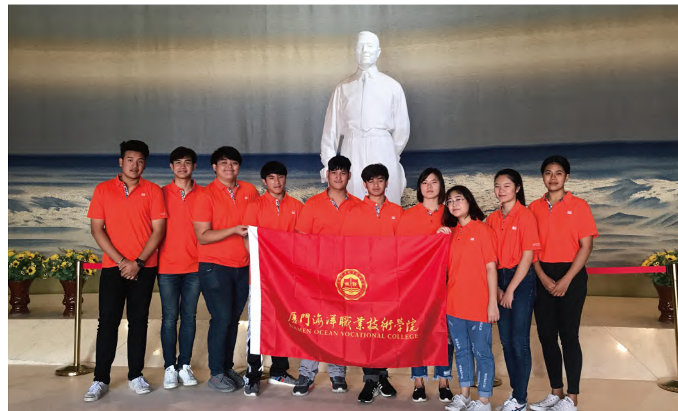
International Students Visiting the Memorial Hall of TAN KAH KEE