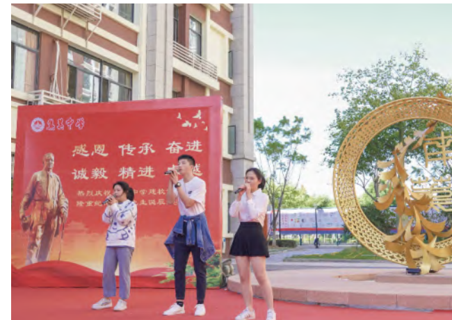
Nanxun Music Square