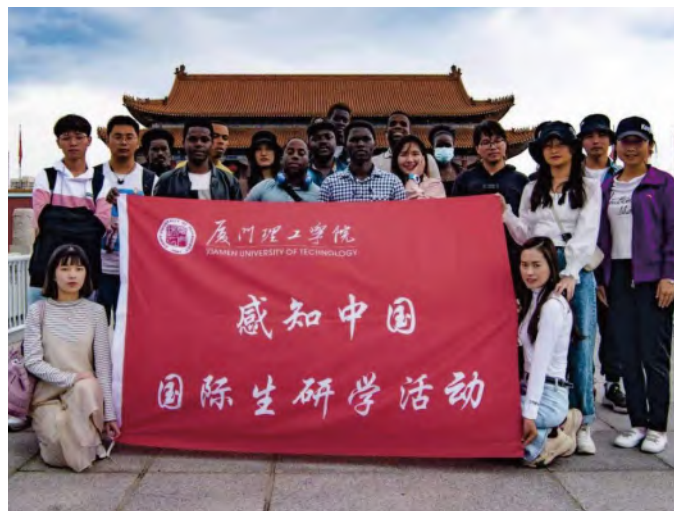
"Experience China" International Student Research Program