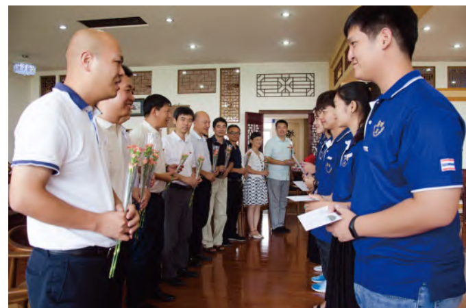
Master Worship Ceremony for Thai Students