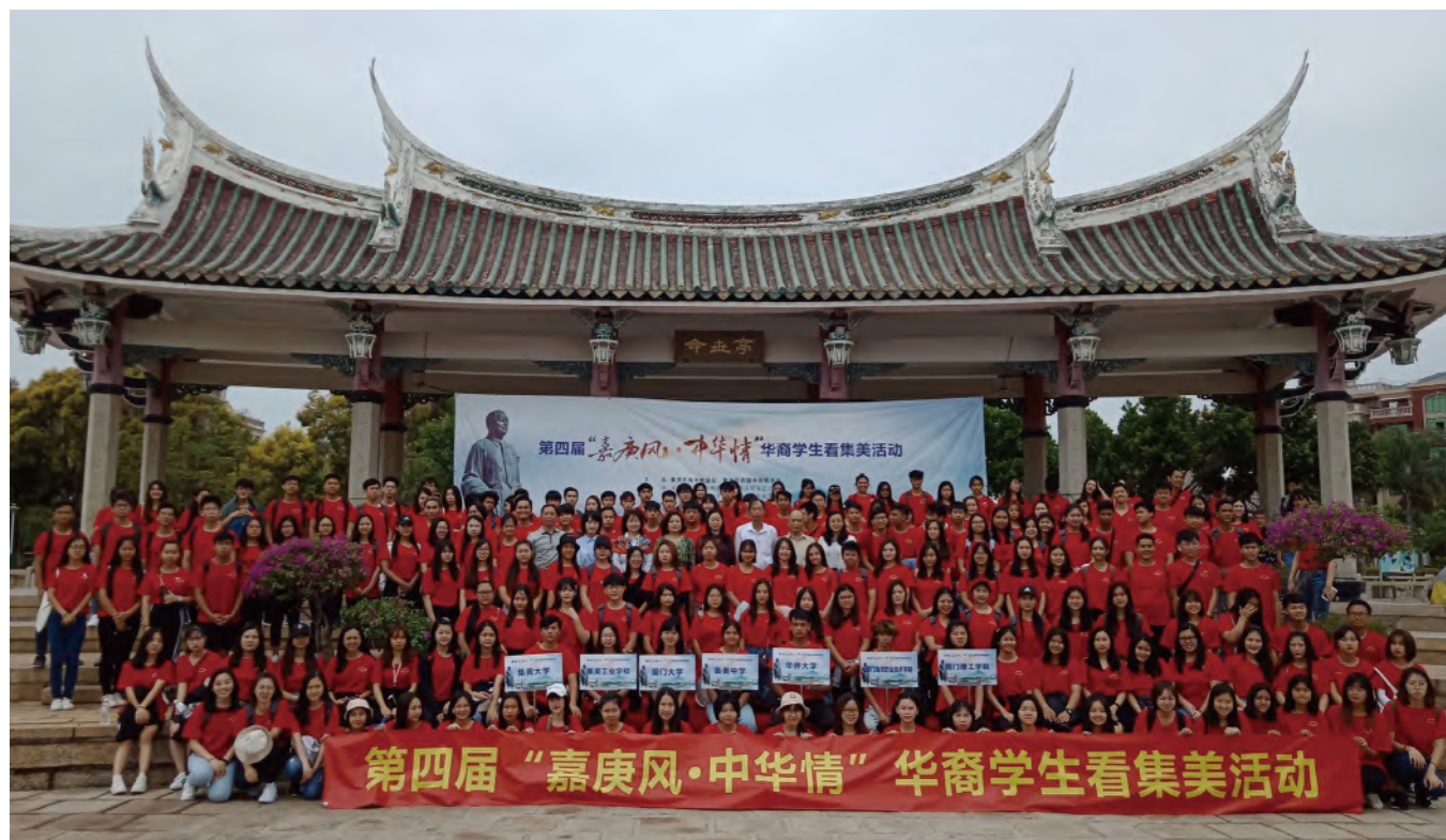
The 4th "KAH KEE Wind, Chinese Feeling" Oversea Chinese Students Watching the Beauty Collection Activity