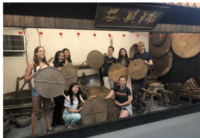
International Students' Experiencing Activities of Ancient Fujian Culture in the Gulong Sauce Cultural Park